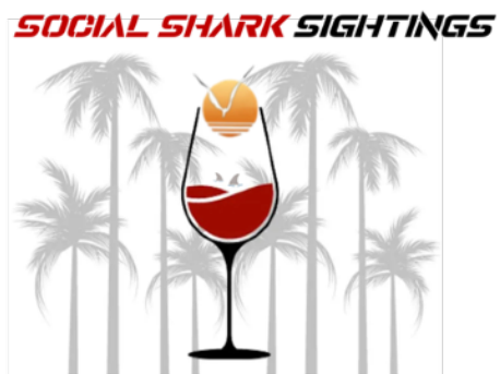
Sharks met at Deep Lagoon for the September monthly Club dinner.